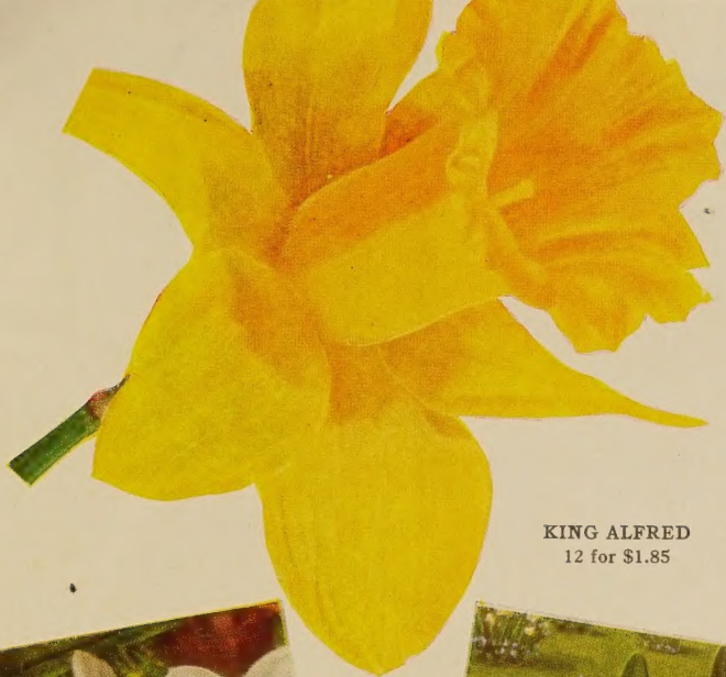
KING ALFRED 12 for $1.85